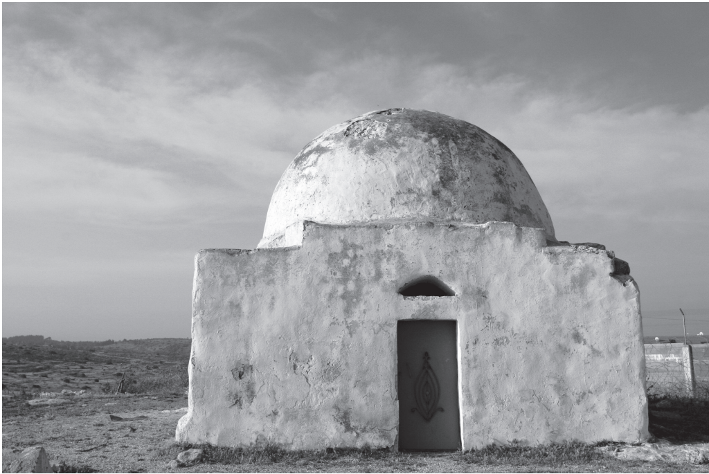
Habla, Qalqiliya Governorate.

beautiful rural homes, add a further dimension to this wealth of cultural diversity. The desert monasteries on the eastern plateaus form yet another type of architecture in Palestine, in addition to being an important marker of religious development and a historical testimony of religious thought. The sacred shrines spread throughout the countryside and in cities are emblems of various forms of worship. Diversity is also found in the architecture of the throne villages, which are feudal palaces in the Palestinian countryside from the 18th and 19th centuries. The caravansaries along the historical trade routes and the beautiful rough stone terraces along Palestine's chain of hilly peaks are further proof of the wealth of Palestine's material cultural heritage.