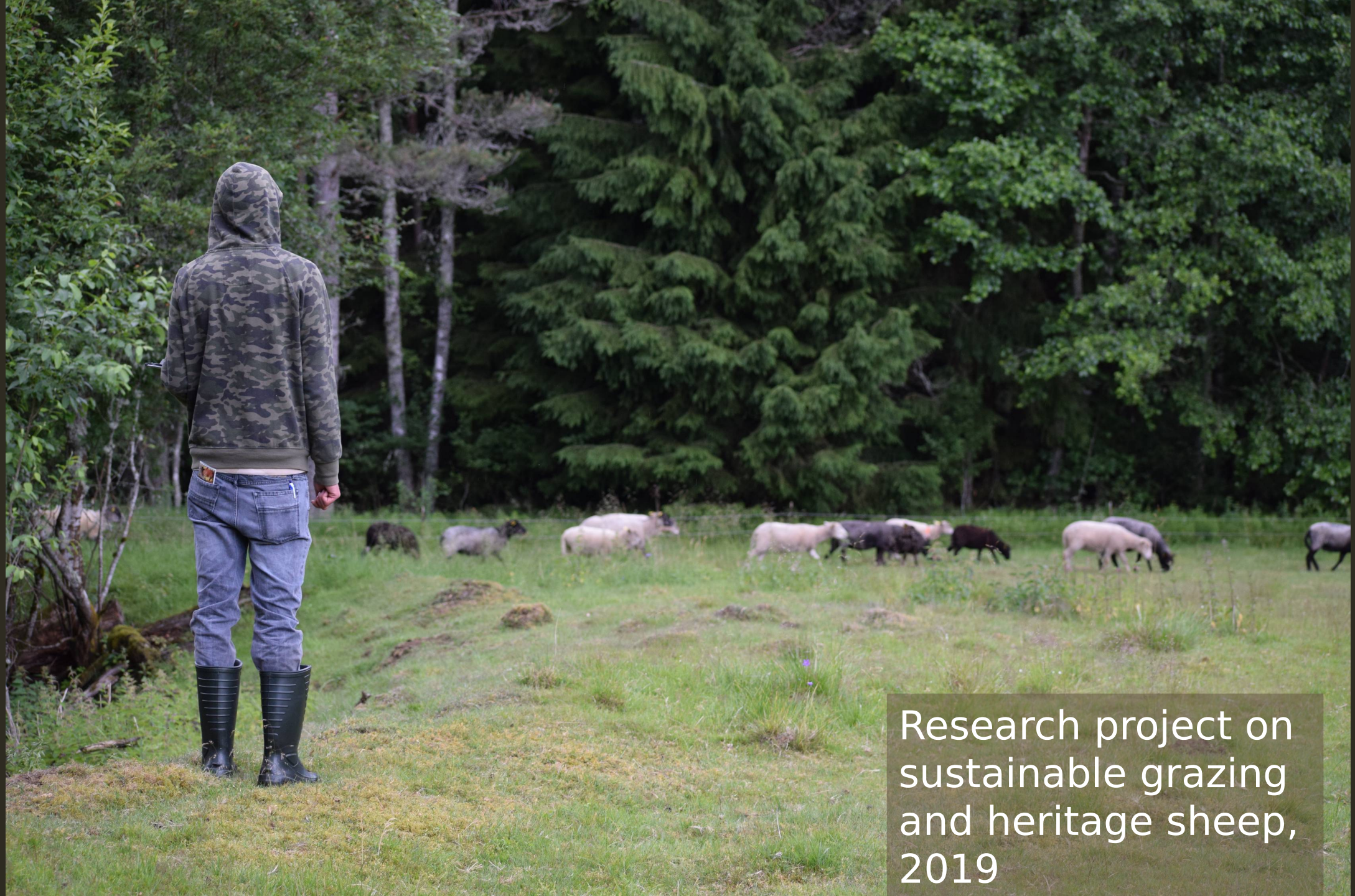
Research project on sustainable grazing and heritage sheep, 2019