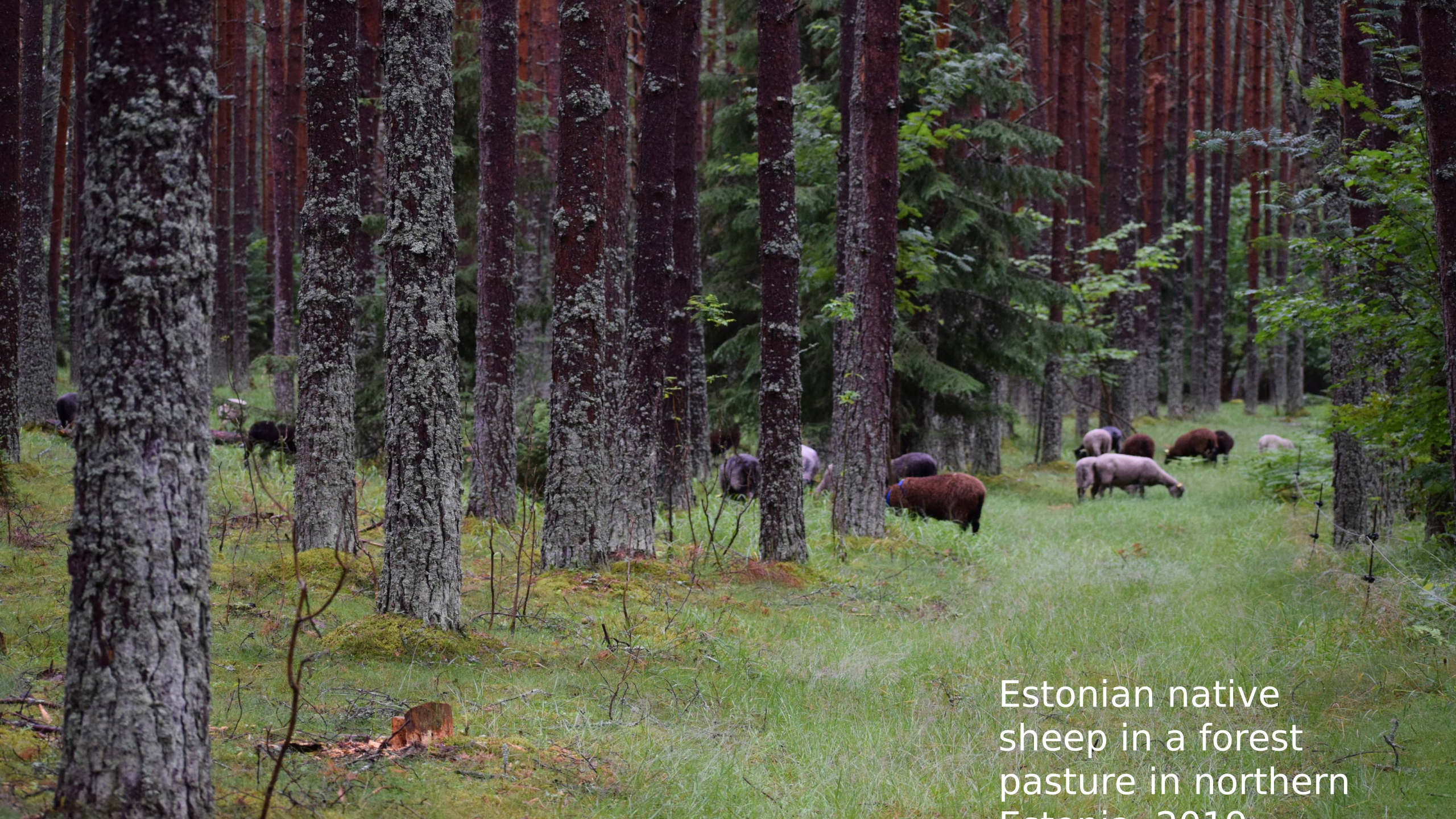
Estonian native sheep in a forest pasture in northern Estonia, 2010