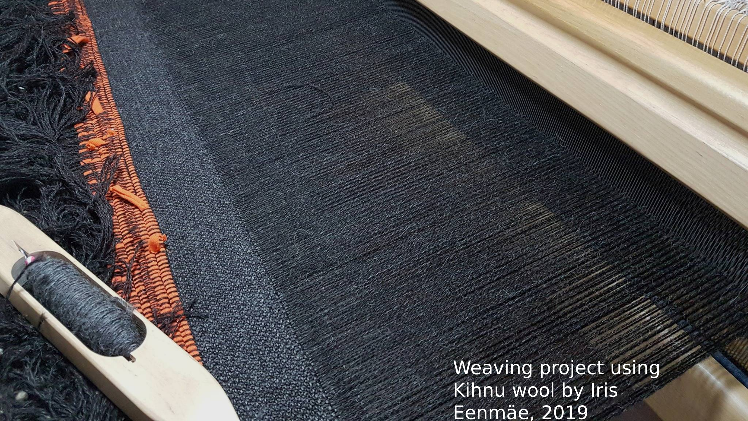
Weaving project using Kihnu wool by Iris Eenmäe, 2019