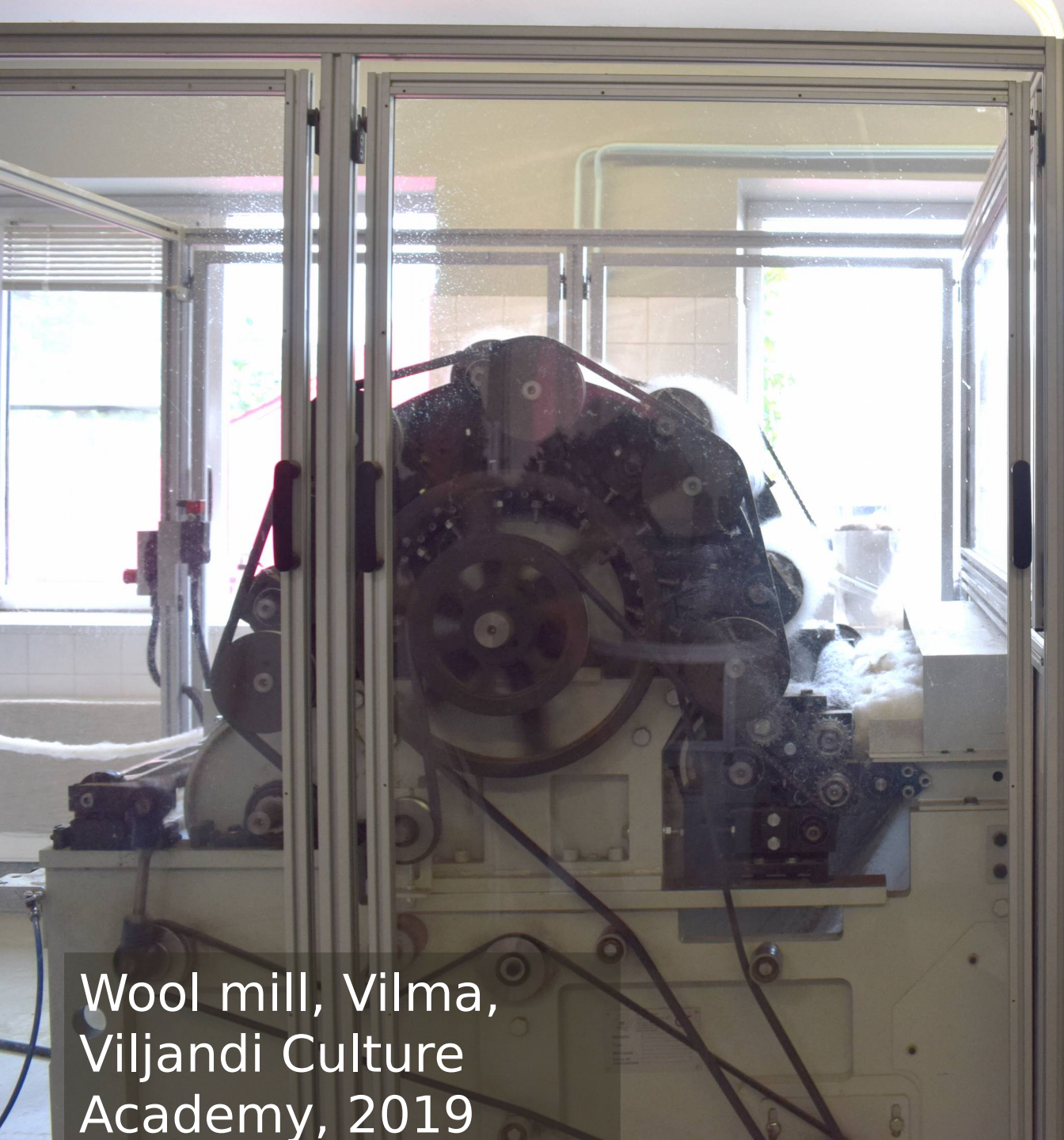
Wool mill, Vilma, Viljandi Culture Academy, 2019