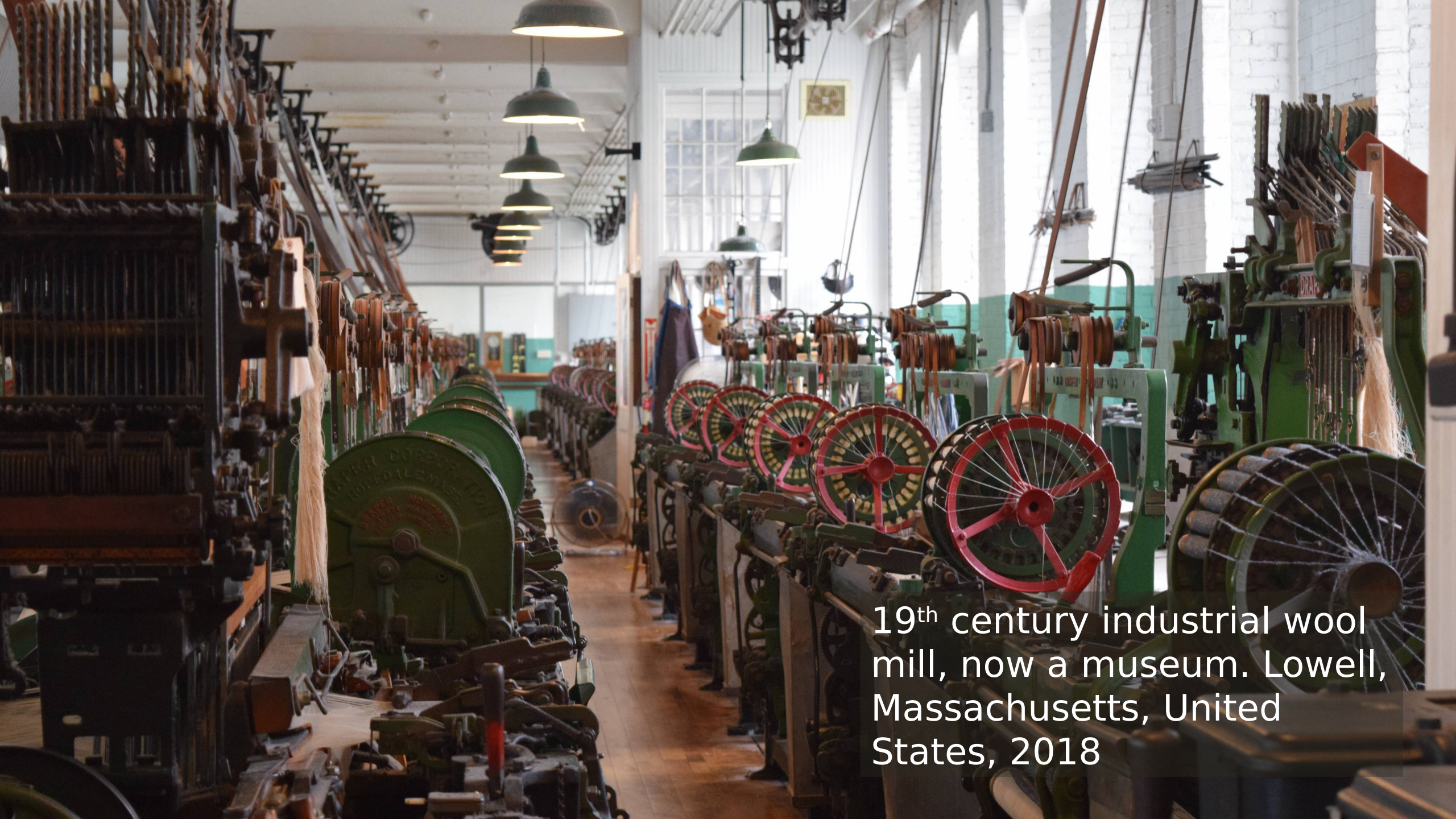
19 th century industrial wool mill, now a museum. Lowell, Massachusetts, United States, 2018