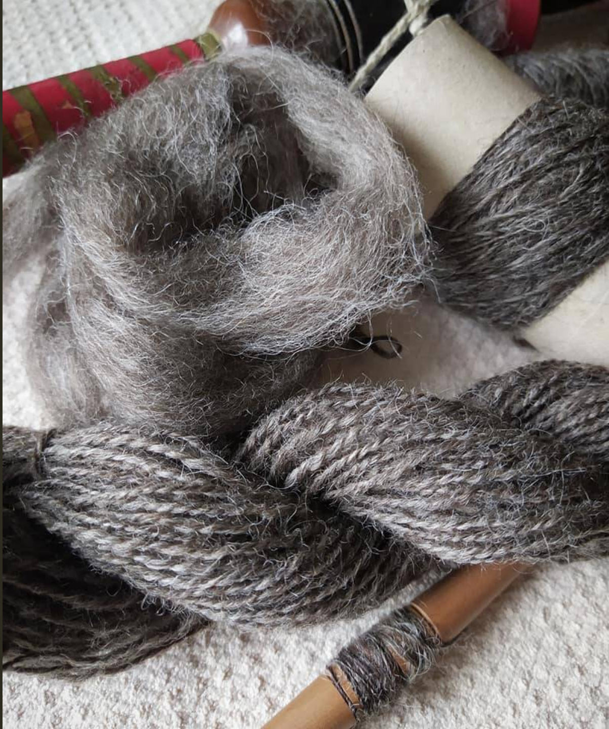
Author's samples from spindle spinning study of Kil...