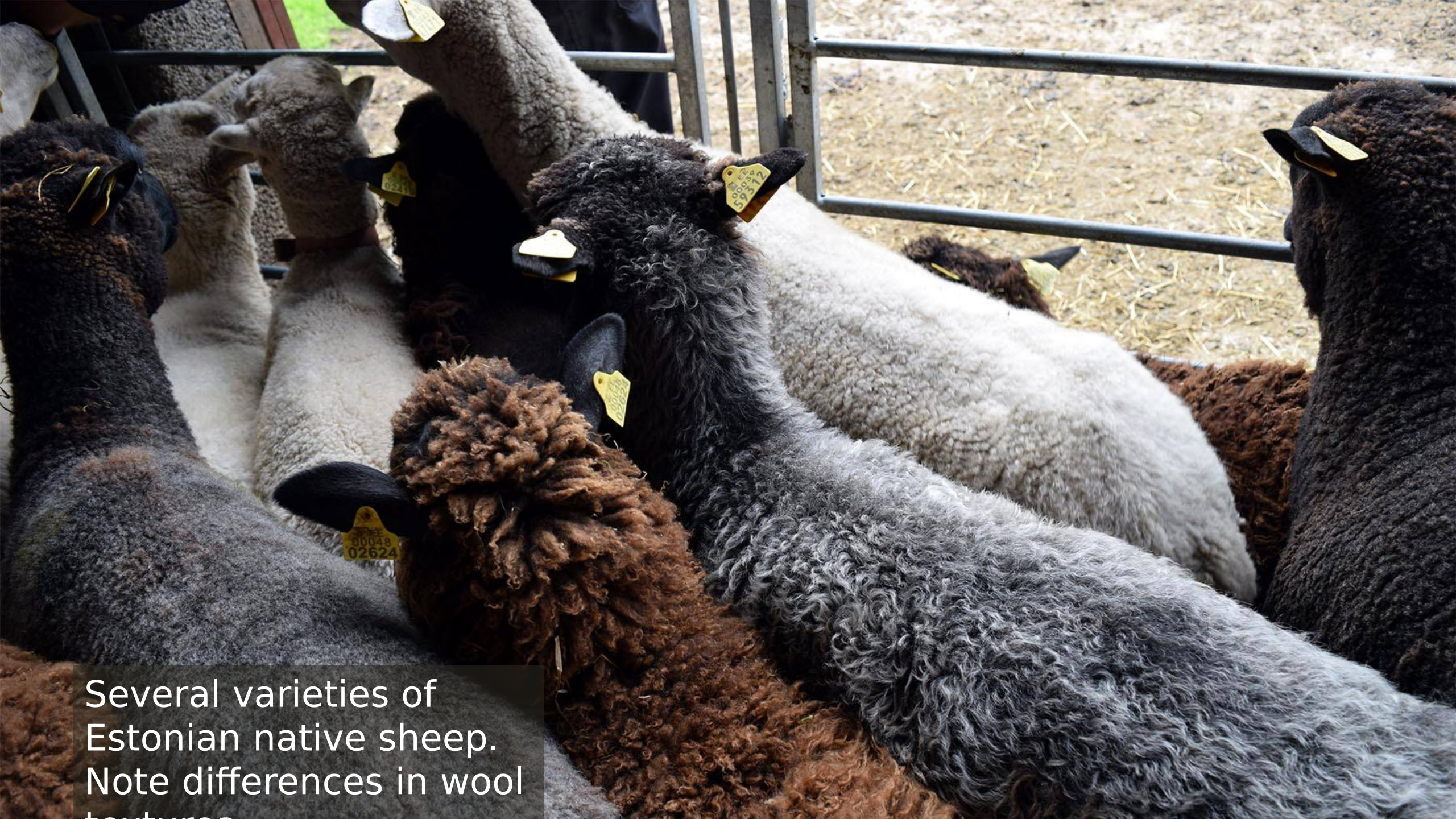
Several varieties of Estonian native sheep. Note differences in wool textures.