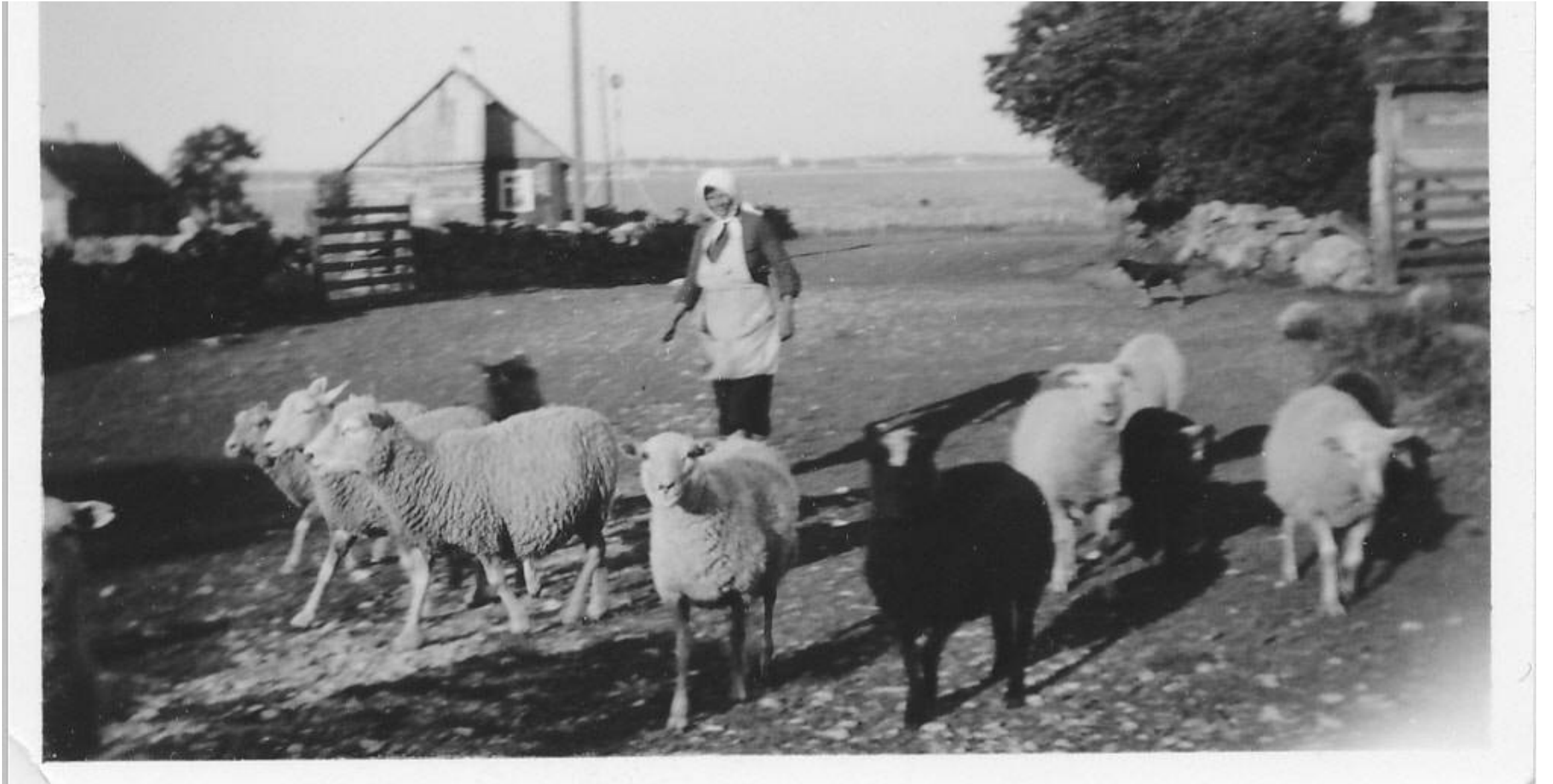
Ruhnu Island - RrM F 776: 2 F