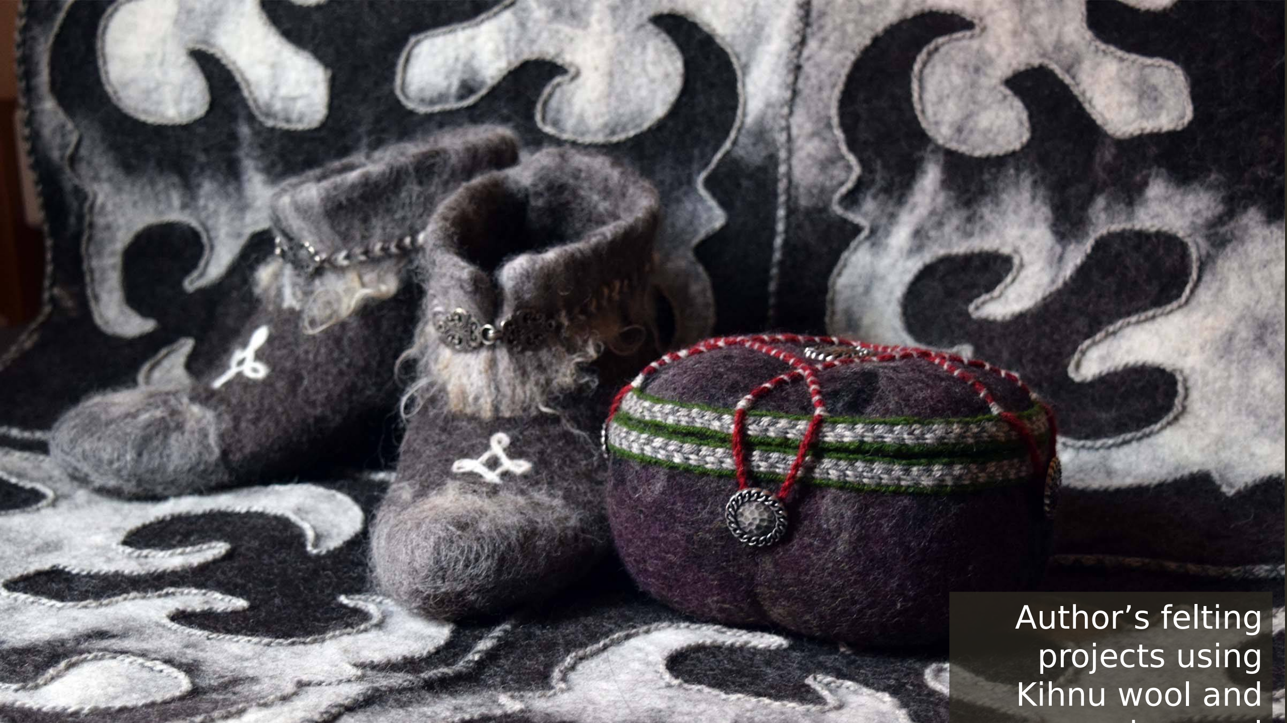
Author's felting projects using Kihnu wool and