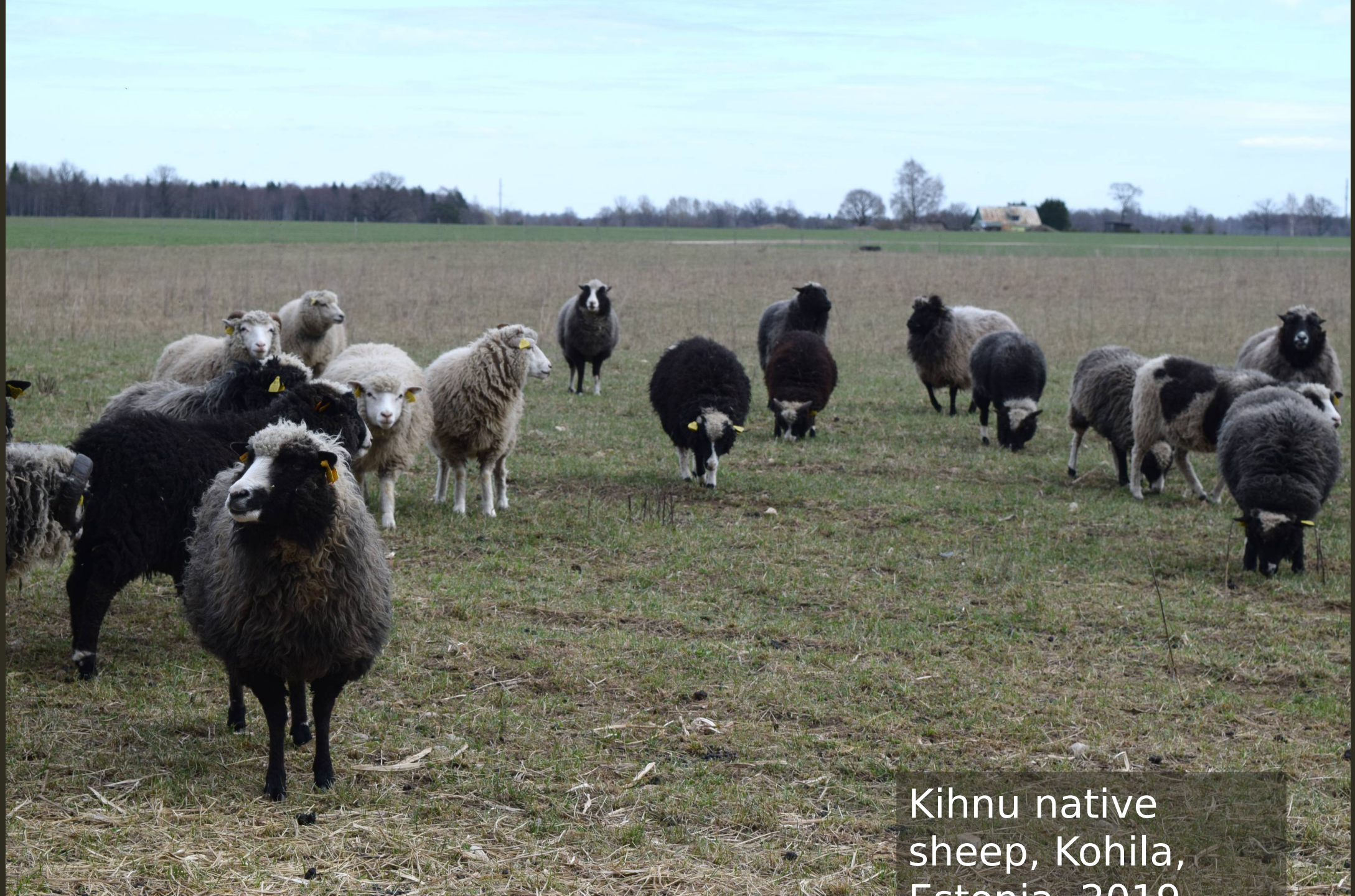
Kihnu native sheep, Kohila, Estonia 2010