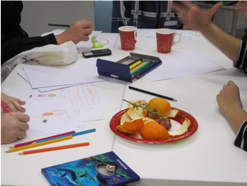
Figure 1. Scene from the workshop (Estonia).

In the following stage of the workshop, the students were to draw and describe the possible social media platforms this imaginary character might be using. These two stages were then repeated, but with instructions of making the character 12, and eventually 14, years old coupled with written statements. After having drawn and written about the 12 years old character, the young were handed laptop computers (all of which had Internet access) and were given an opportunity to continue working on constructing this imaginary character on the computer. Although all the groups both in Estonia and in Sweden hence decided to construct a 14 year-old character by creating them a profile on the Internet, Estonian students did not make any drawings of the 14 years old character. Rather they went straight on continue developing the imaginary characters for whom they had already created “personal” Facebook profiles. The Swedish pupils did make drawings of also the 14 years old, as well as updating their online profiles.